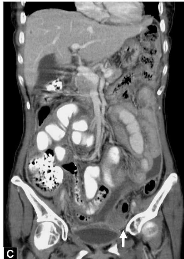
(C) Coronal contrast-enhanced CT scan demonstrates the disproportionate left ovarian mass (arrow) with loculated ascites, in contrast to the usual findings of ovarian cancer.