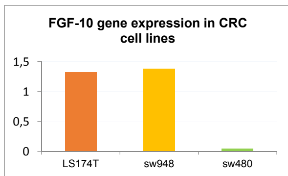
Figure 3: FGF-10 gene expression in colorectal cancer cell lines

Quantitative analysis showed that the FGF-10 gene expression is increased in LS174T ( 1.32 \pm 0.72 ) and SW-948 ( 1.37 \pm 0.13 ) while it is decreased in SW-480 ( 0.06 \pm 0.01 ) (see Figure 3).